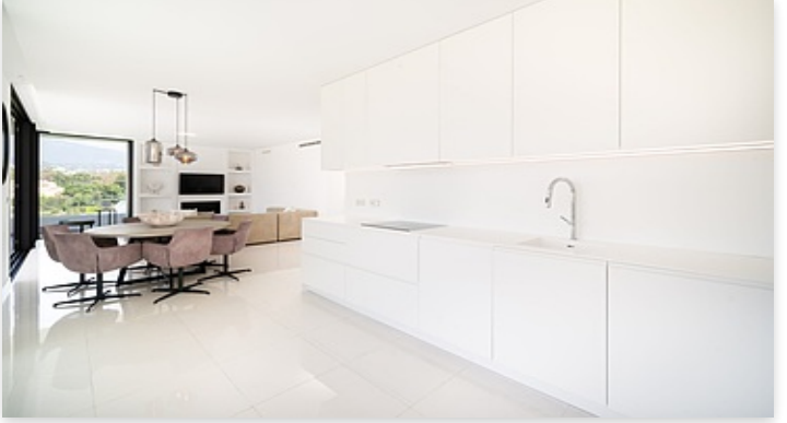
Exceptional modern 3 bed duplex penthouse apartment in Atalaya – Estepona